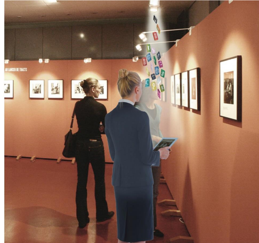
GEOLIFI Location Based Services