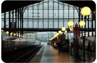
Public Area: Train station