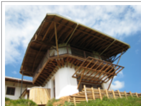
La Miñoca in La China