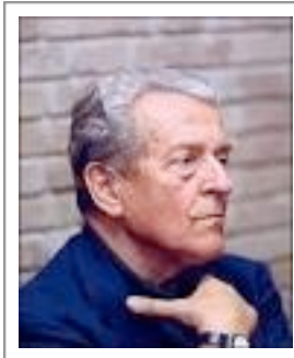
Carlo Ripa di Meana

Had I ever mastered mathematics in high school, I would have opted for a career in building design. Ideas unfold before my mind's eyes and, though I never had the gift of drawing, actions ensure the implementation of these visions. I was first directly involved with a grand building project when I took over the leadership of a small Belgian detergent maker on the brink of bankruptcy. I re-launched the company by resolutely opting to construct Europe's first ecological factory. It was a gamble to spend 100 million Belgian Franks when the turnover was only 120 million at the time. In October 1992, when Carlo Ripa di Meana, the European Commissioner for the Environment, and Lester Brown, the founder and then president of the Worldwatch Institute, inaugurated the facility, CNN covered it on Prime Time News. This secured it a place in the annals of green design. The booklet on the building was distributed for free and described, open source, all the materials, costs and decisions made.