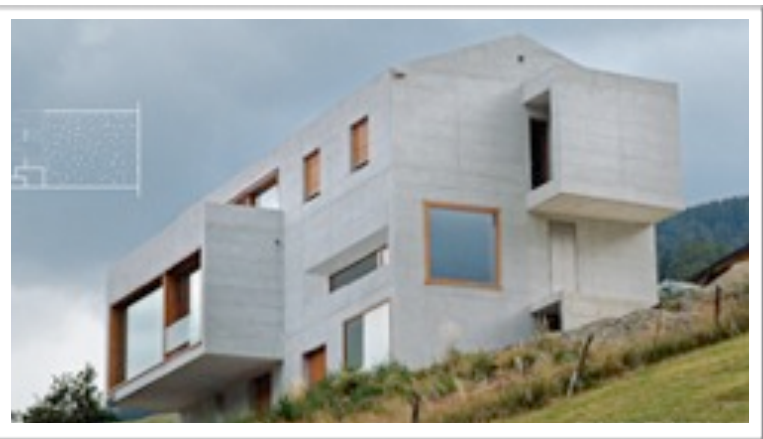
Glass foam house in Switzerland by Misapor

The product portfolios and the production techniques we were able to witness on both sides of the Atlantic demonstrated that, more than substituting a bottle, it is about substituting multiple different products with a potential to shift resource efficiency by a factor of one hundred or more. Glass can always be reconditioned and always be recycled. It should be viewed as an asset and not as a cost on balance sheets. When the market leader leaves such an opportunity untouched and one entrepreneur shows the inroads that could be made, it invites more competition. At ZERI, information is always shared open source and, since products like foam glass are local products that could enter many niches, new initiatives across the globe would not compete against each other. Pittsburgh Corning had a late wake-up call, and created a new production unit in Klasterc (Czech Republic). Now that the pressure is on, as described below, the company is constructing a facility in China to meet growing demand there. While Earth Stone continues to focus on the vast US market, it also ventured into the Netherlands with its growstone product range for horticulture and greenhouses. This encouraged others, such as tomato farmers, to be pro-active entrepreneurs.