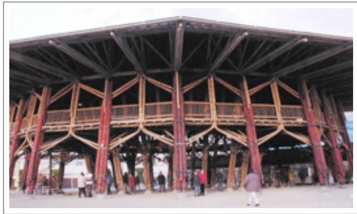
The ZERI Pavilion at the World Expo 2000 in Hanover