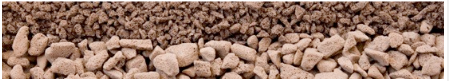
Rockstone made from recycled glass as a growth medium © EarthStone

Glass recycling turned into a platform technology, penetrating multiple sectors. This is the pre-condition to provide a framework where one innovative business model stimulates dozens to innovate. One of the applications to unfold was foam glass as a growth medium for tomatoes and strawberries in greenhouses. Foam glass is highly porous, free of chemicals, and offers soil aeration while providing the right water balance to the roots. The production technique allows the growth medium to be customized to fit a wide range of plants and farming techniques. Considering that most hydroponic growth substrate is mined perlite or hydroton, this innovative application puts glass in an unending cycle. Foam glass can be reconditioned back into the next season's growth medium. It shows that a non-biodegradable product can be highly ecological, provided there is a solid effort spent on creating the loop. The success of "growstone" stimulated Gay and her team to spin off the business into a separate unit.