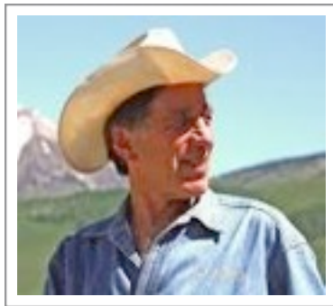
Harvey Stone © Stone

The creative team at Earth Stone designed two additional product lines: consumers cleaning and personal care products, and industry abrasives, aggregates and filtration medium. The "QuickSand" sanding block lasts longer than sandpaper and each block is made from one beer bottle. The cleaning products for swimming pools and kitchens are alternatives based on "physics" rather than toxic chemicals. The four business sectors of Earth Stone and the experience of research, which started without previous experience in the field, resulted in a highly flexible foam glass production design that could accommodate nearly any technical requirement from the customer. The highly standardized volume production from Belgium stands now in stark contrast with the highly flexible small runs in the US.