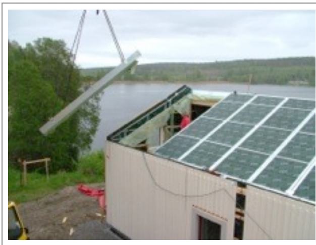
Glass foam in a prefabricated housing system designed by Åke Mård

Foam glass is 97% air, mainly CO 2 and sequesters it for about one hundred years providing a convenient way to reduce it in the atmosphere. These millions of tiny bubbles not only regulate temperature, they do not let any humidity through either. Furthermore, glass only melts at 1,100°C and does not catch fire, eliminating, or at least seriously reducing, the need for fire retardants. When I analyze any innovation, I look for a strong start. This was a strong start. Then I learnt that the raw material could be old glass. Pittsburgh Corning the Belgium-based supplier located in Tessenderlo, which started production in 1965, uses broken car windshields. This means that foam glass scores high on resource efficiency. Glass cannot be destroyed, it can only be transformed. This light foam also has structural strength, not just an insulating ability. The series of characteristics it has offer "multiple benefits and multiple cash flows", a core condition of the Blue Economy.