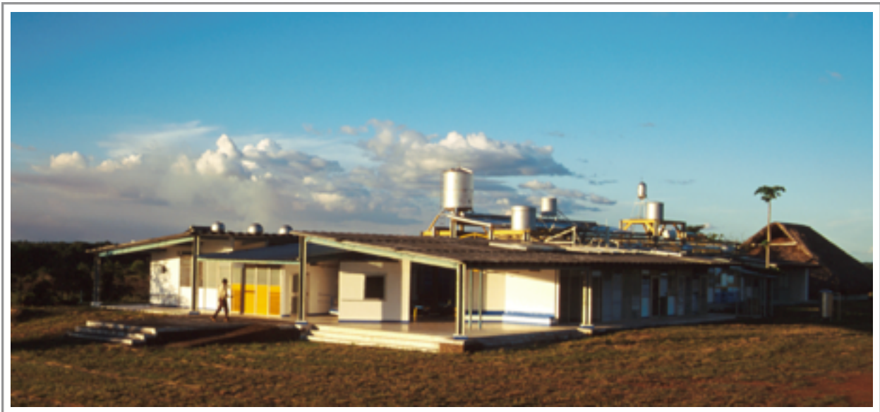
The self-sufficient hospital with 24 beds at Las Gaviotas, Colombia

Two years later I was privileged to monitor the design and construction of the first self-sufficient hospital at Las Gaviotas in the Vichada of Colombia under the leadership of Paolo Lugari. The shift from a wooden industrial structure in a temperate climate to a public service building in a hot, humid, tropical climate provided the contrast that permitted me to learn fast track how to design green buildings using available resources and the local climatological conditions. The team enjoyed complete freedom from regulations and even from insurance companies, but faced strict yet ambitious targets: it was to become the first hospital self-sufficient in power and water with a budget limited to US$300,000. The team of 15 had only one architect. The surgeon's room represented the greatest lesson in architectural design. Traditional wind patterns were combined with underground tunnels and equipped with aluminum rods to condensate the moisture. The uninterrupted airflow through the ducts secured fresh and dry air with humidity levels always under 17%, without using pumps or power thanks to a continuous under-pressure. Every system was driven by natural flows.