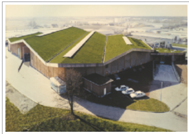
The Ecover Factory from the air in 1993